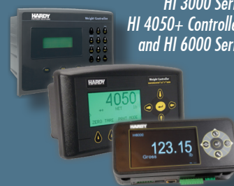
HI 3000 Series HI 4050+ Controllers and HI 6000 Series