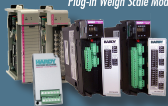
Allen-Bradley® Compatible Plug-in Weigh Scale Modules

Controllers, Weigh Modules, Transmitters