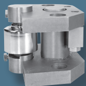
ADVANTAGE® Series Load Point with C2 Calibration

Hardy carries a wide variety of strain gauge load points and scale bases to accommodate your application requirements.